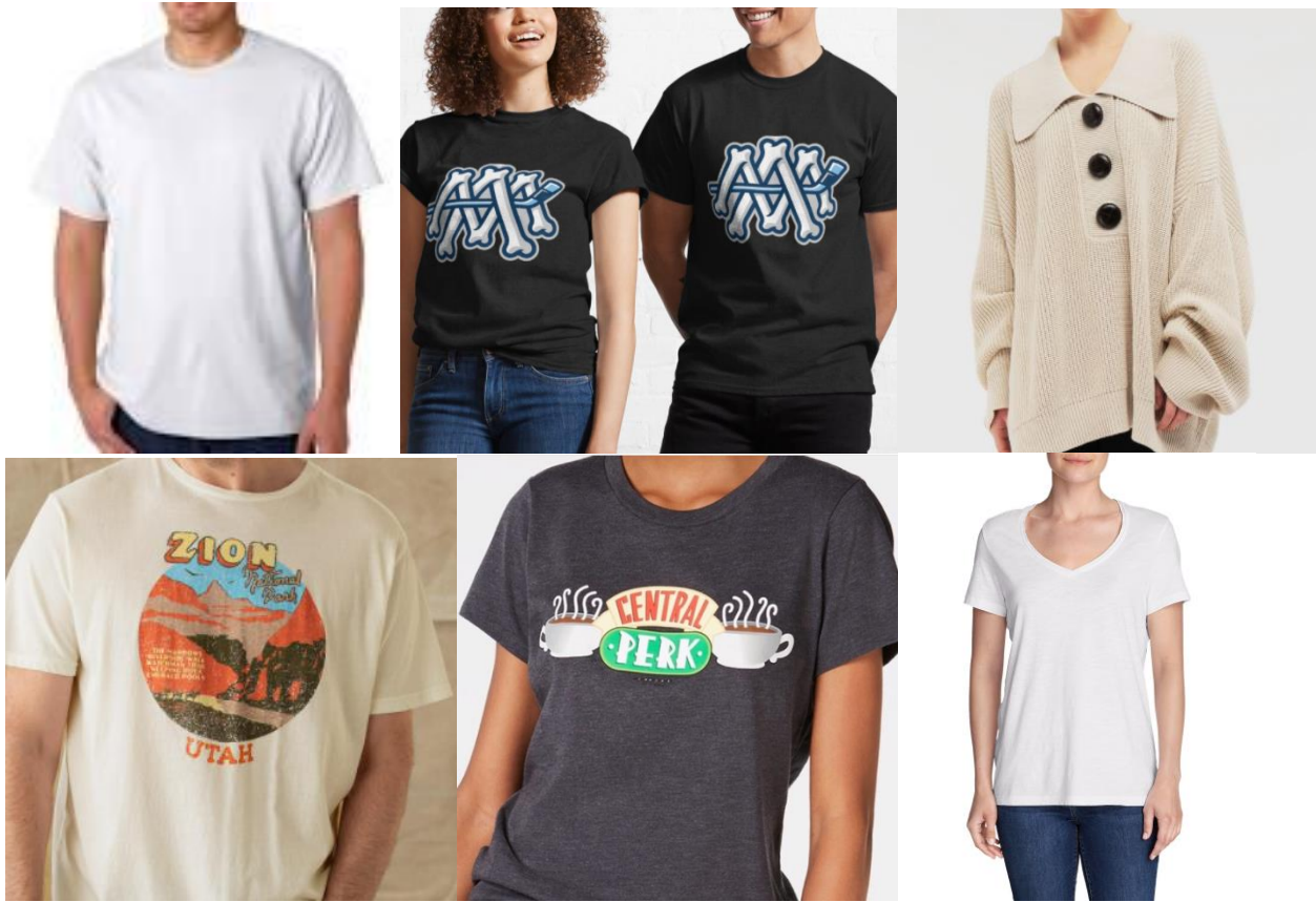
Example of “Acceptable” Tops: